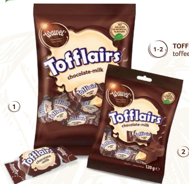
1-2 TOFFLAIRS CHOCOLATE-MILK - chocolate toffee soft candies with milk filling