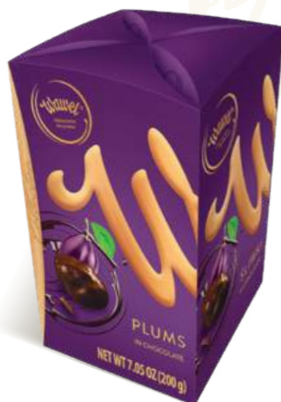
4 PLUMS IN CHOCOLATE