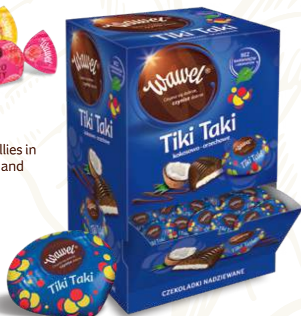
2 TIKI TAKI – chocolate pralines with coconut and peanut filling