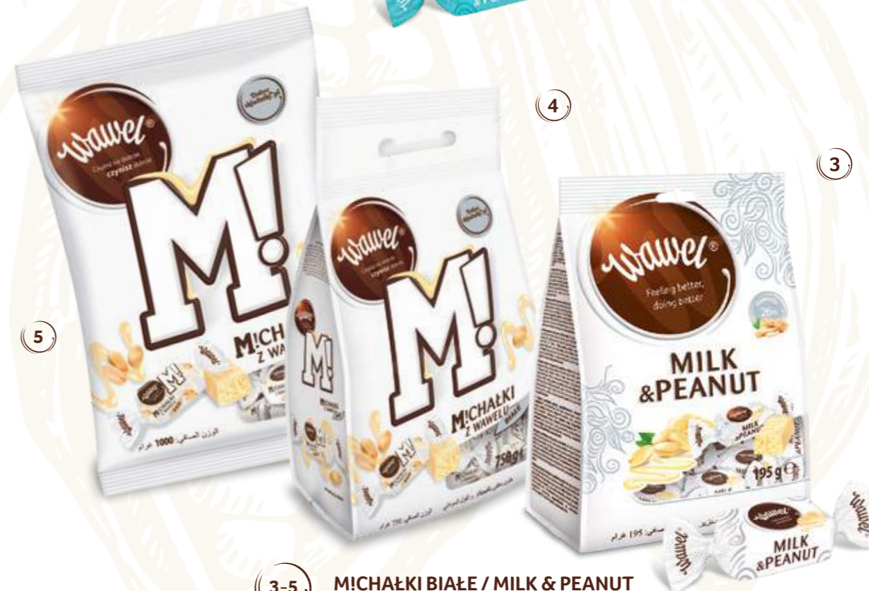
3-5 MICHĄŁKI BIAŁE / MILK & PEANUT - white compound coated peanut candies