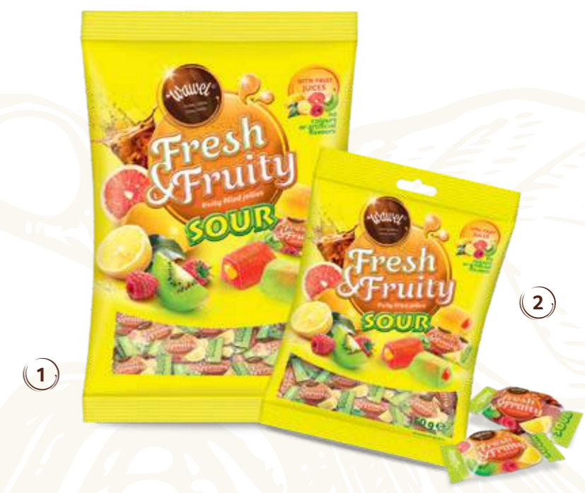
1-2 FRESH & FRUITY SOUR - mix of sour jellies with fruity filling: kiwi and lemon with raspberry filling, grapefruit and cola with lemon filling