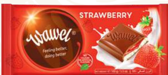
6 STRAWBERRY – milk chocolate with strawberry-yoghurt filling