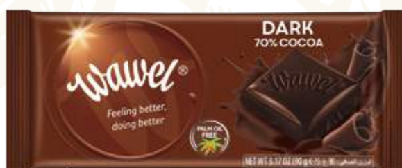
2 DARK – plain dark chocolate 70% cocoa