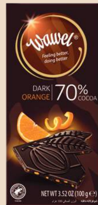
3 PREMIUM DARK 70% ORANGE

* Rainforest Alliance Certified - find out more on ra.org