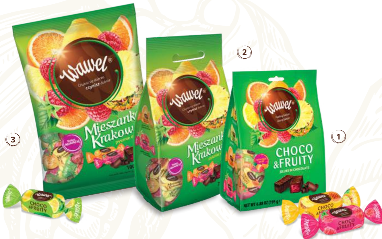
1-4 MIESZANKA KRAKOWSKA / CHOCO & FRUITY- jellies in chocolate in four flavours: orange, raspberry, lemon and pineapple