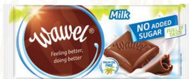
2 NO ADDED SUGAR MILK CHOCOLATE