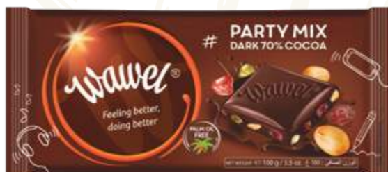
6 PARTY MIX DARK 70% – dark chocolate with jellies, peanuts and raisins