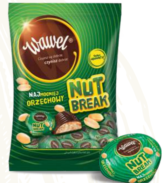
2 NUT BREAK – chocolate pralines with salted peanut filling