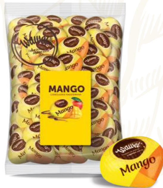
2 MANGO – chocolate pralines with mango filling