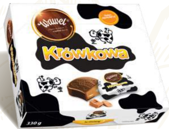
2 KRÓWKOWA- milk chocolate pralines with caramel filling