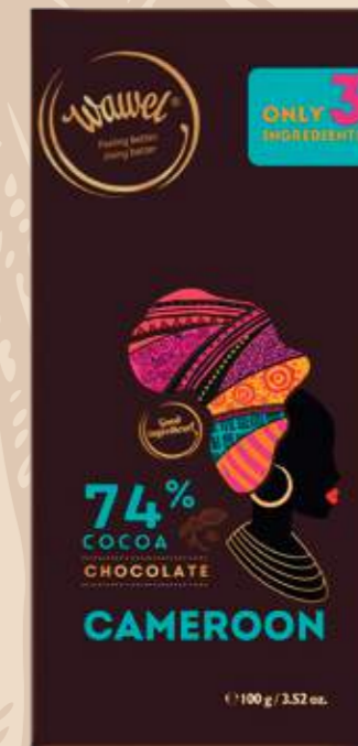
2 PREMIUM DARK 74% CAMEROON