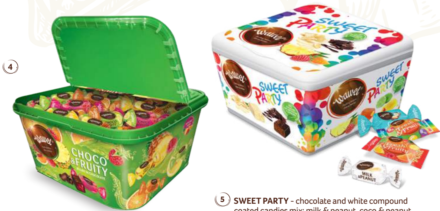
5 SWEET PARTY - chocolate and white compound coated candies mix: milk & peanut, coco & peanut