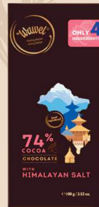
3 PREMIUM DARK 74% HIMALAYAN SALT