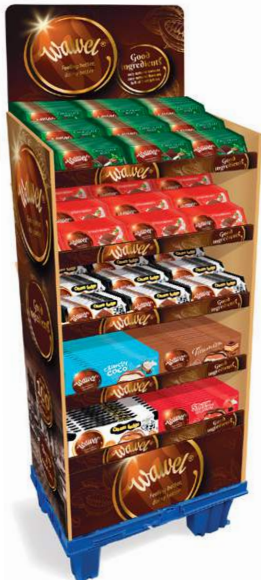
Mix of regular chocolate bars 100 g & big chocolate bars 278 - 300 g