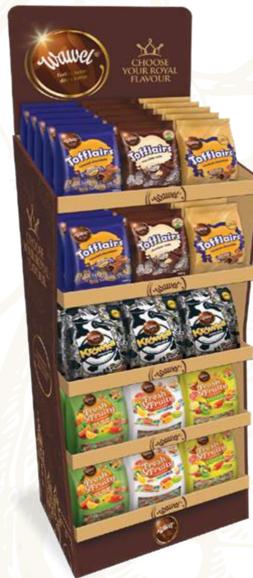
Mix of bags 1000 g