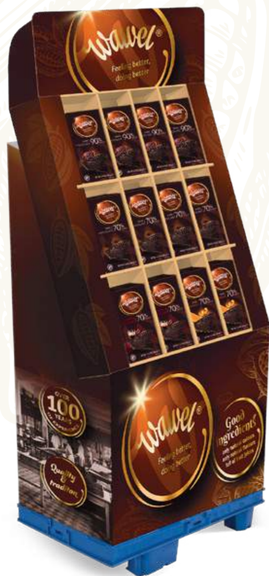
Premium Line. Mix of chocolate bars 100 g