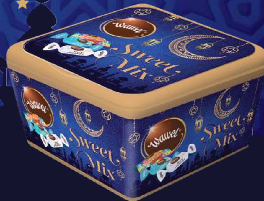
1 SWEET MIX - compound coated candies mix: milk & peanut, coco & peanut, Fresh&Fruity

YOUR CHOICE WHAT TO BUY FROM WAWEL BUY 1KG OF MIX OF WAWEL PRODUCTS AND TAKE A DEDICATED CARDBOX FOR FREE.