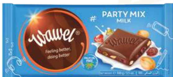
7 PARTY MIX MILK – milk chocolate with jellies, peanuts and raisins