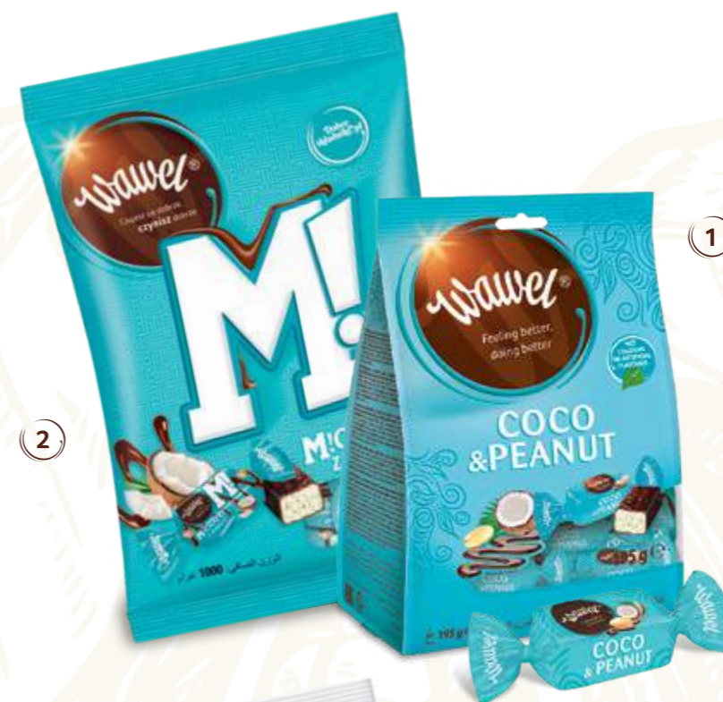
1-2 MICHĄŁKI KOKOSOWE / COCO & PEANUT - chocolate coated coconut candies