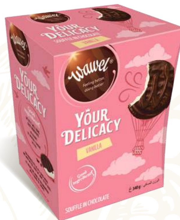
1 YOUR DELICACY VANILLA- vanilla soufflé in chocolate