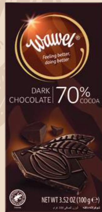
2 PREMIUM DARK 70% COCOA