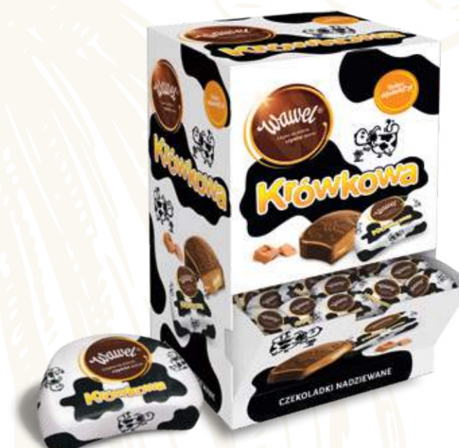
2 KRÓWKOWA – milk chocolate pralines with caramel filling