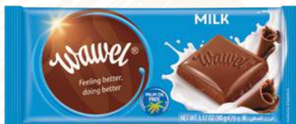
1 MILK – plain milk chocolate