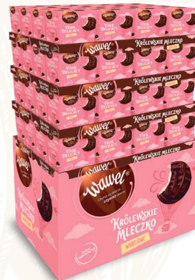
Your Delicacy 340 g Gift Box Exposition