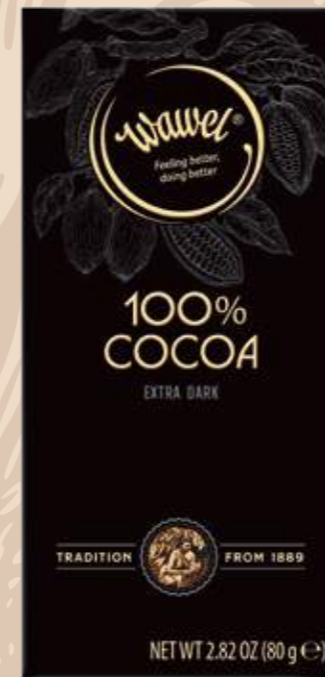
1 PREMIUM EXTRA DARK 100% COCOA