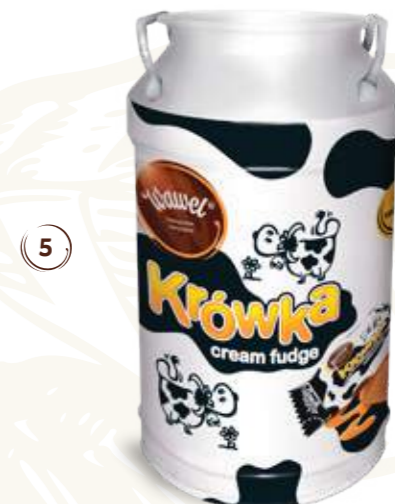
4-7 KRÓWKA MLECZNA / CREAM FUDGE (flow pack wrapped)