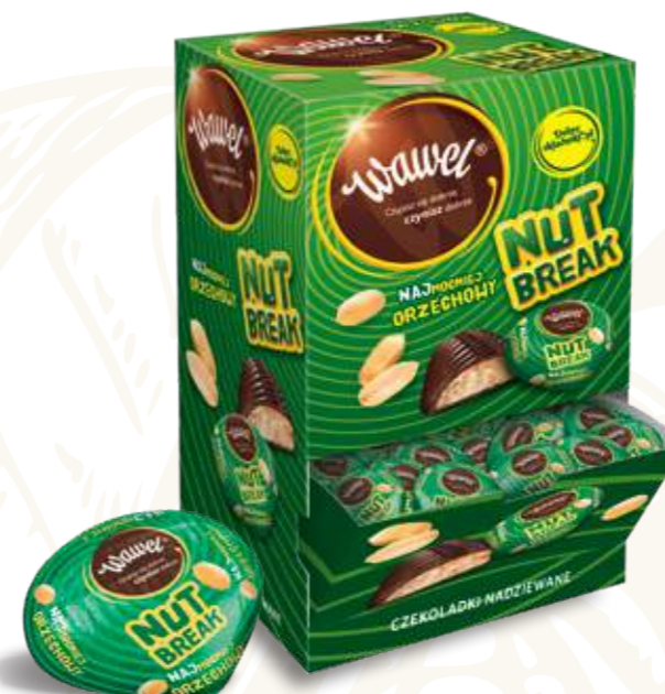
1 NUT BREAK – chocolate pralines with salted peanut filling