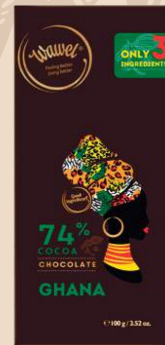
4 PREMIUM DARK 74% GHANA