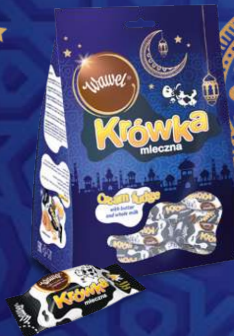
1 KRÓWKA MLECZNA / CREAM FUDGE (Flow pack wrapped)