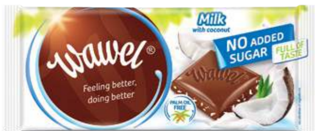
4 NO ADDED SUGAR MILK CHOCOLATE WITH COCONUT