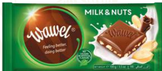
5 MILK & NUTS – milk chocolate with peanuts