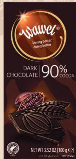
1 PREMIUM DARK 90% COCOA