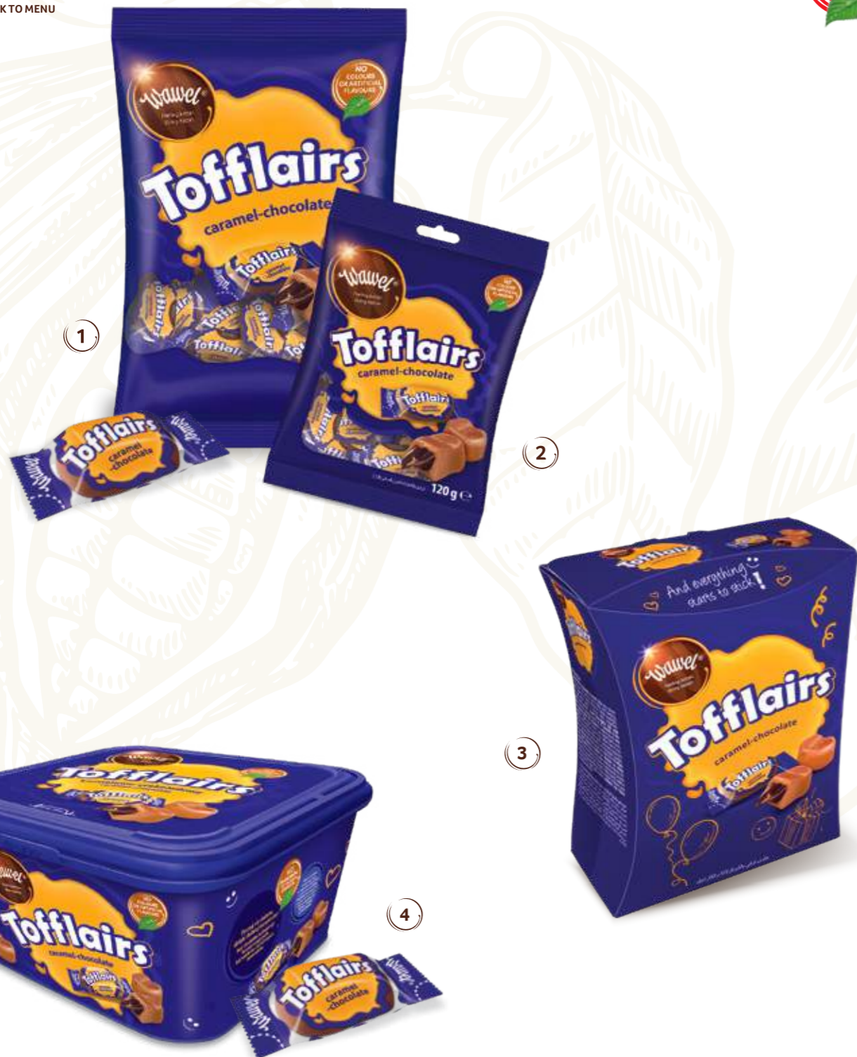
1-4 TOFFLAIRS CARAMEL-CHOCOLATE - caramel toffee soft candies with chocolate filling