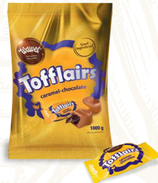
3 TOFFLAIRS CARAMEL-CHOCOLATE - caramel toffee soft candies with chocolate filling