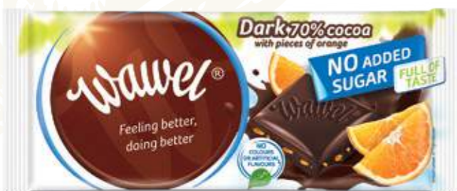
3 NO ADDED SUGAR DARK 70% COCOA CHOCOLATE WITH ORANGE