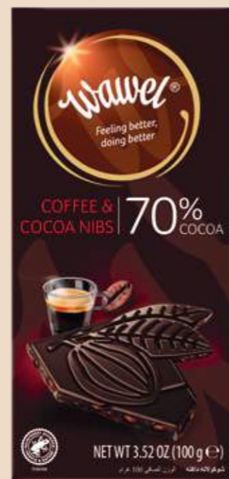
4 PREMIUM DARK 70% GROUND COFFEE & COCOA NIBS