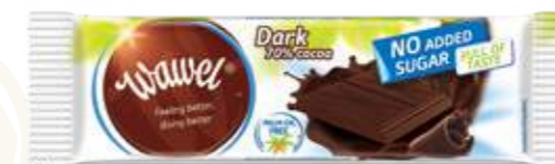
1 NO ADDED SUGAR DARK 70% COCOA SMALL CHOCOLATE BAR