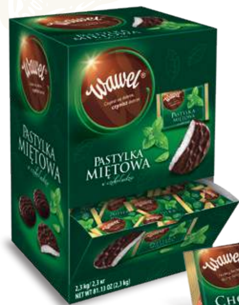
3 CHOCOLATE MINT - chocolate coated mint pastilles