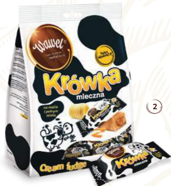
1-2 KRÓWKA MLECZNA / CREAM FUDGE (flow pack wrapped)