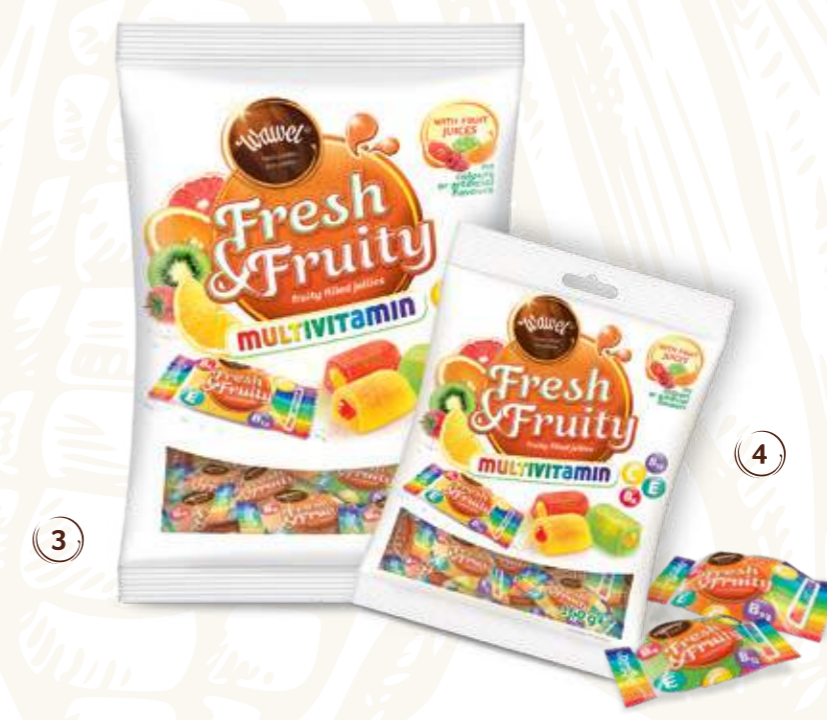
3-4 FRESH & FRUITY MULTIVITAMIN - mix of jellies with fruity filling with additional vitamins: grapefruit with lemon filling, kiwi with lemon filling, orange with raspberry filling, lemon with raspberry filling