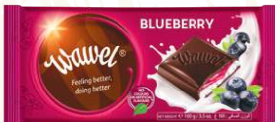
7 BLUEBERRY – dark chocolate with blueberry-yoghurt filling