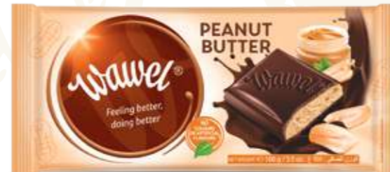
2 PEANUT BUTTER – dark chocolate with salted peanut filling