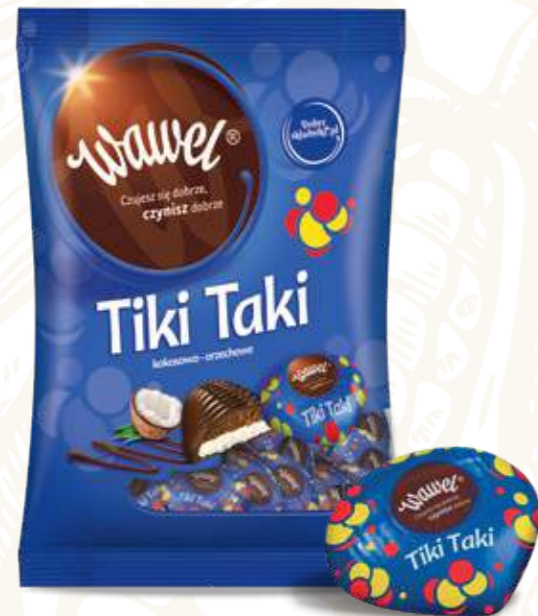
1 TIKI TAKI – chocolate pralines with coconut and peanut filling