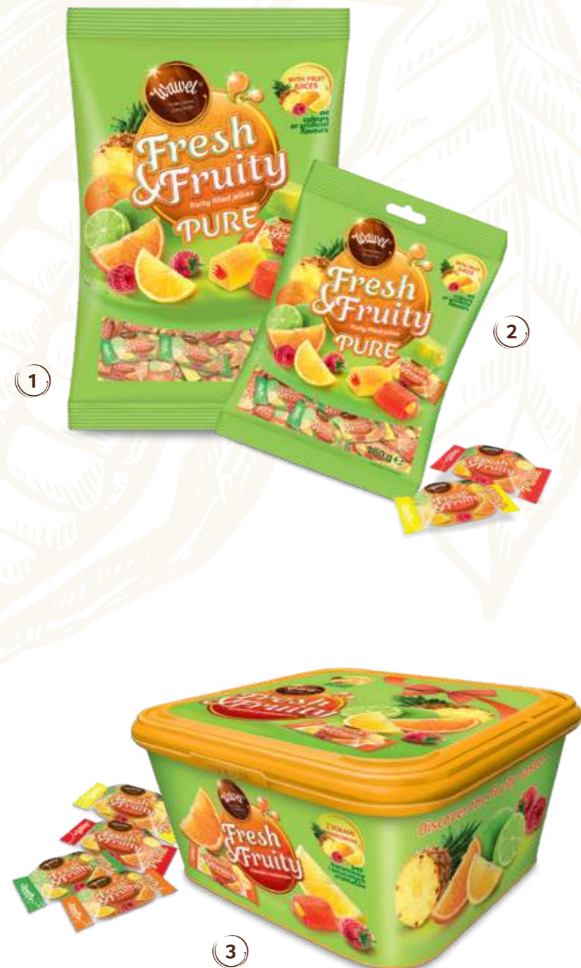
1-3 FRESH & FRUITY PURE - mix of jellies with fruity filling: pineapple and orange with raspberry filling, raspberry and lime with lemon filling