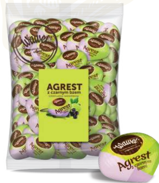
3 AGREST Z CZARNYM BZEM – chocolate pralines with gooseberry with elderberry filling