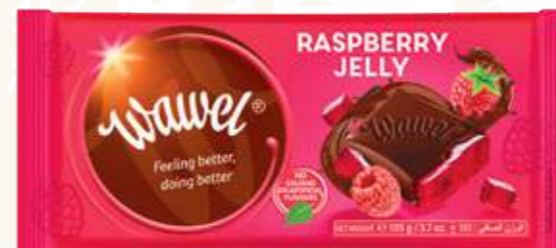
4 RASPBERRY JELLY – dark chocolate with raspberry jelly filling