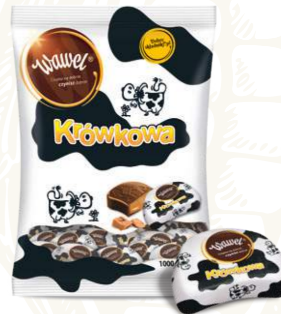
3 KRÓWKOWA – milk chocolate pralines with caramel filling