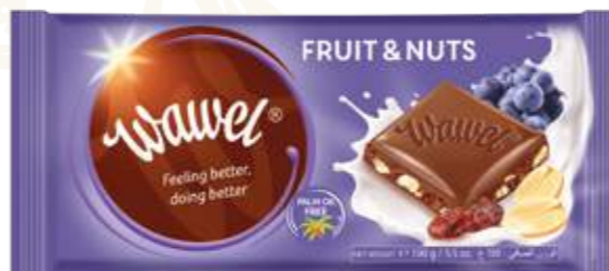
4 FRUIT & NUTS – milk chocolate with raisins and peanuts