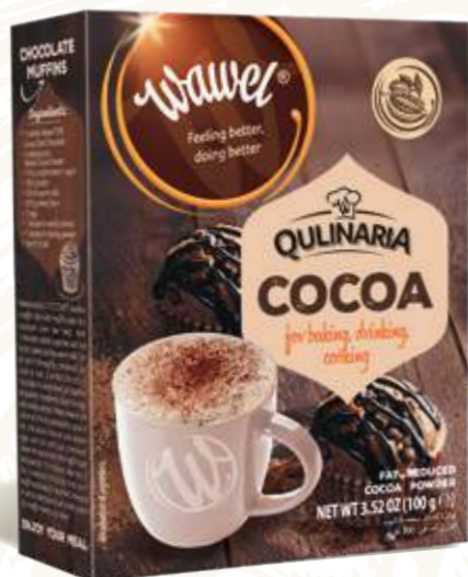
1 COCOA - fat reduced cocoa powder