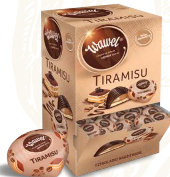
3 TIRAMISU – chocolate pralines with tiramisu flavour filling