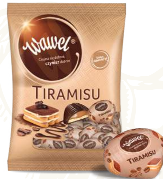
1 TIRAMISU – chocolate pralines with tiramisu flavour filling