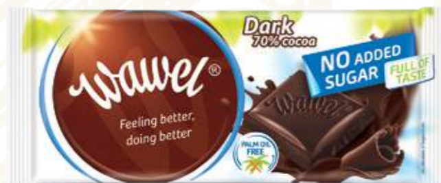
1 NO ADDED SUGAR DARK 70% COCOA CHOCOLATE