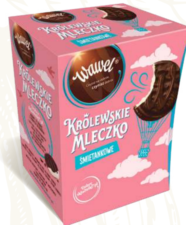
2 KRÓLEWSKIE MLECZKO CREAMY- creamy soufflé in chocolate