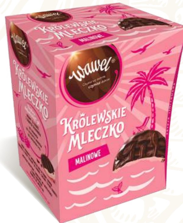
3 KRÓLEWSKIE MLECZKO RASPBERRY- raspberry soufflé in chocolate