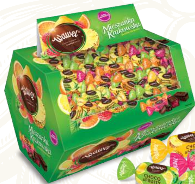
1 MIESZANKA KRAKOWSKA / CHOCO & FRUITY- jellies in chocolate in four flavours: orange, raspberry, lemon and pineapple