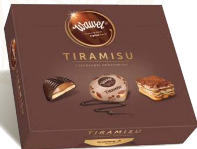
3 TIRAMISU - chocolate pralines with tiramisu flavour filling