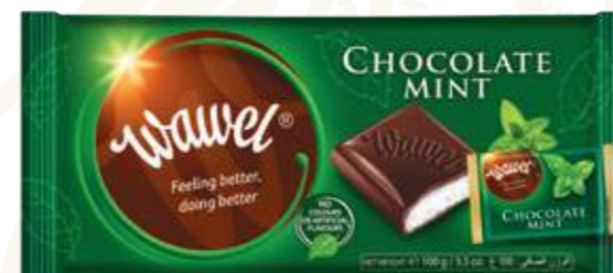
3 CHOCOLATE MINT – dark chocolate with mint filling